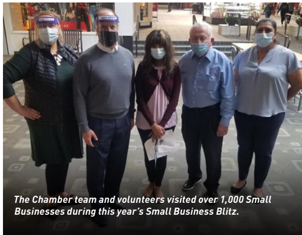
The Chamber team and volunteers visited over 1,000 Small Businesses during this year's Small Business Blitz.