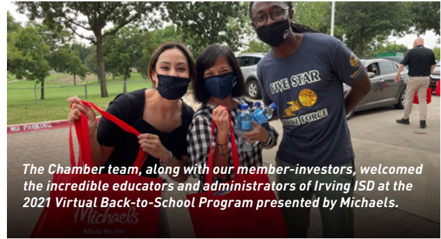
The Chamber team, along with our member-investors, welcomed the incredible educators and administrators of Irving ISD at the 2021 Virtual Back-to-School Program presented by Michaels.