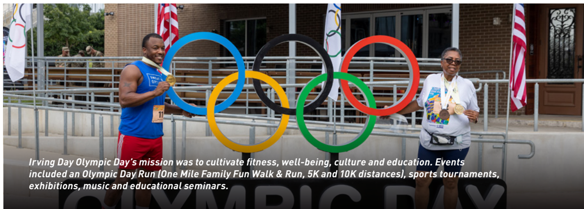
Irving Day Olympic Day's mission was to cultivate fitness, well-being, culture and education. Events included an Olympic Day Run (One Mile Family Fun Walk & Run, 5K and 10K distances), sports tournaments, exhibitions, music and educational seminars.

Additionally, we continue to provide protocol services and serve as a liaison to Irving's six Sister Cities. Our team is working to establish relationships that may lead to other Sister Cities, including in Asia, Panama and other countries. The Sister Cities program has been critical as we work to develop relationships virtually to aid our business community's expansion into other global markets.