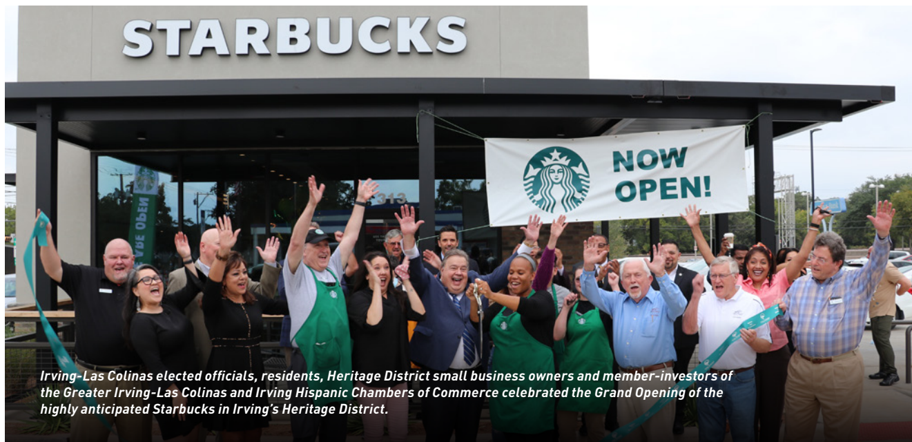
Irving-Las Colinas elected officials, residents, Heritage District small business owners and member-investors of the Greater Irving-Las Colinas and Irving Hispanic Chambers of Commerce celebrated the Grand Opening of the highly anticipated Starbucks in Irving's Heritage District.

FY 2020-2021 WAS AN EXTREMELY PRODUCTIVE YEAR. WE LOOK FORWARD TO A SUCCESSFUL 2022 AS WE CONTINUE POWERING PROGRESS FOR OUR BUSINESS INDUSTRY AND THEIR EMPLOYEES, OUR WORKFORCE AND COMMUNITY.