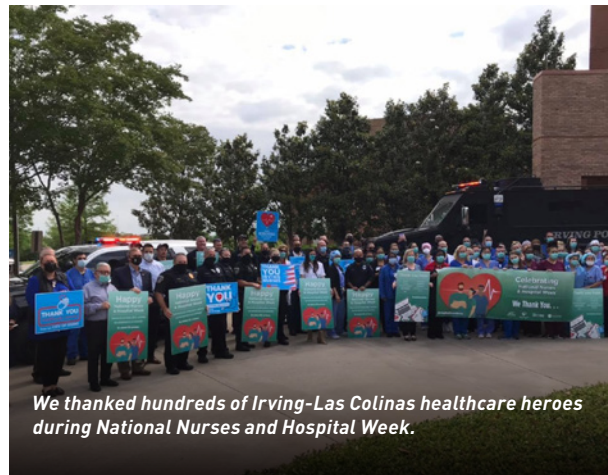
We thanked hundreds of Irving-Las Colinas healthcare heroes during National Nurses and Hospital Week.

SUPPORTING OUR SMALL BUSINESSES CONTINUED TO BE A CHAMBER PRIORITY. WE HOSTED VARIOUS VIRTUAL PROGRAMS, BUSINESS DEVELOPMENT NETWORKING, ONE-ON-ONE PERSONAL OUTREACH, AND FORUMS ON FEDERAL FINANCIAL SUPPORT. WE CONVENED MEETINGS WITH VARIOUS RESOURCE EXPERTS AND HELPED CONNECT SMALL BUSINESSES TO PROCUREMENT OPPORTUNITIES WITH LARGE ENTERPRISE COMPANIES.